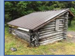
CAPE BALL SHELTER

CAUTION: Cape Ball shelter is 2km south of river mouth